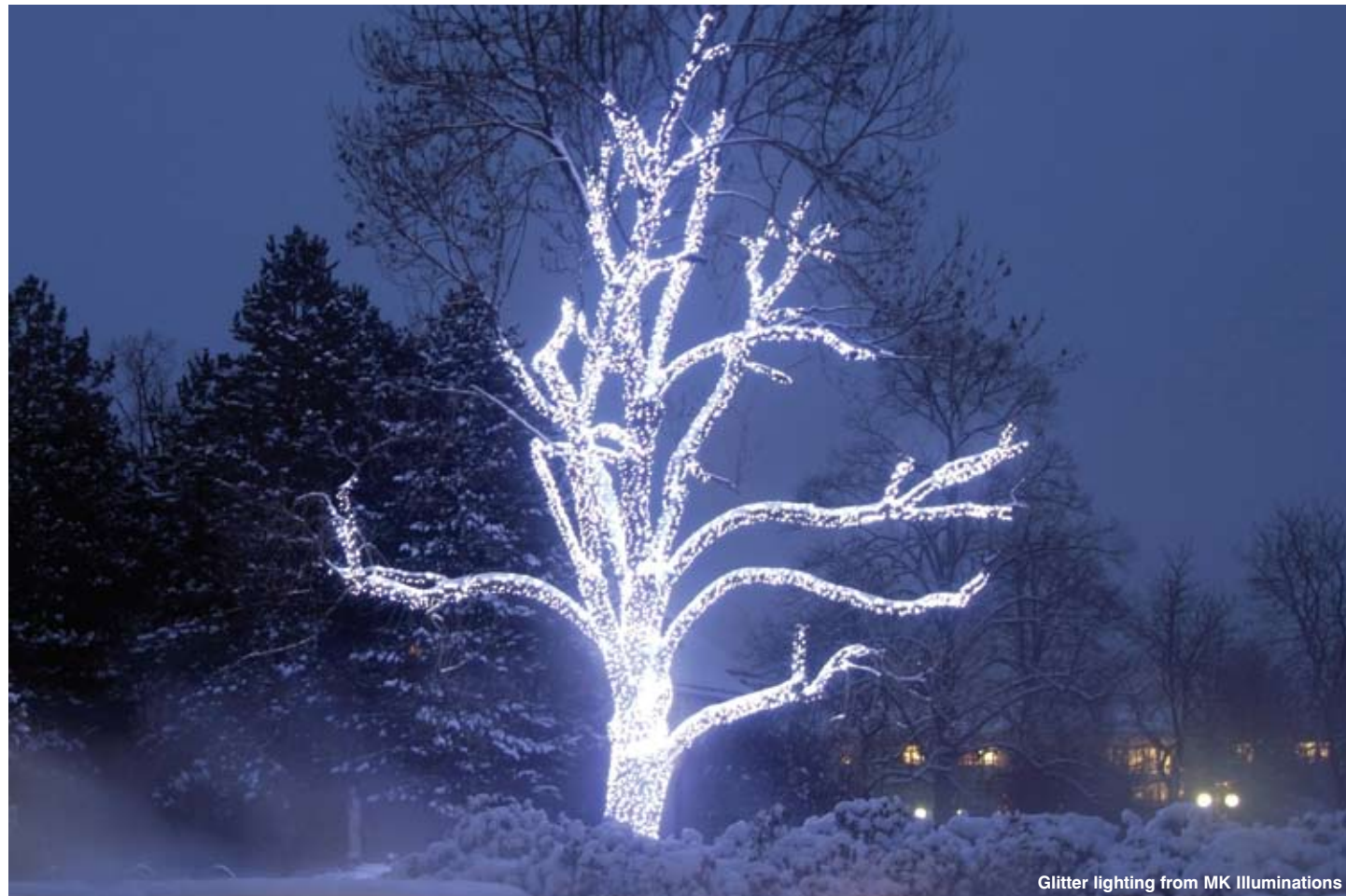
Glitter lighting from MK Illuminations