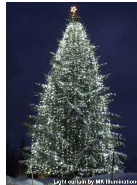
Light curtain by MK Illuminations