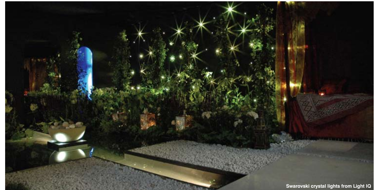
Swarovski crystal lights from Light IQ

The festive season is the one time of the year where the lighting mantra 'less is more' can be put to one side, but do remember that a simple smattering of white lights strategically placed around a garden can sometimes be more appropriate than flooding the exterior of your home with colourful and flickering bulbs. As with every lighting scheme, no matter how temporary, the blanket approach of 'one-size-fits-all' should be avoided with appropriate